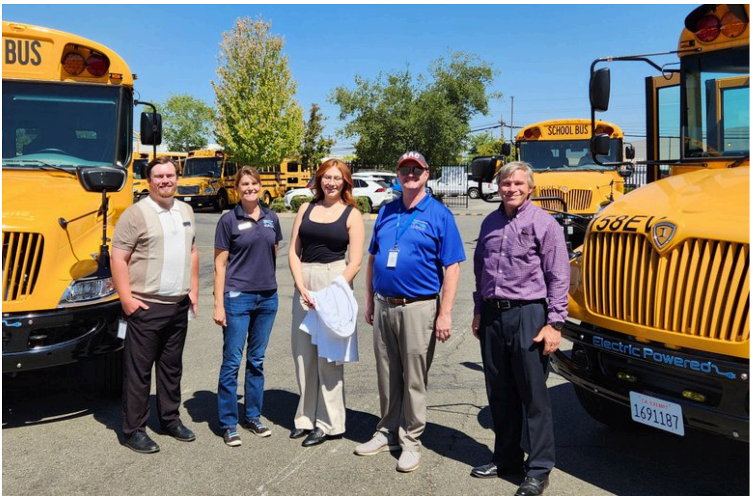
Transportation and Climate Change division team members celebrate the deployment of six new electric school buses for the San Juan Unified School District.