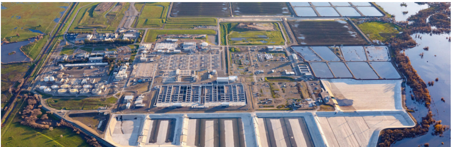
An aerial view of SacSewer's EchoWater facility and the future location of their new bio-gen project.